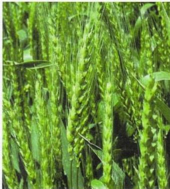
WHEAT: before it is fully ripe.